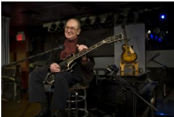
Guitarist Les Paul had a weekly Monday night residency at The Iridium until his death in 2009.