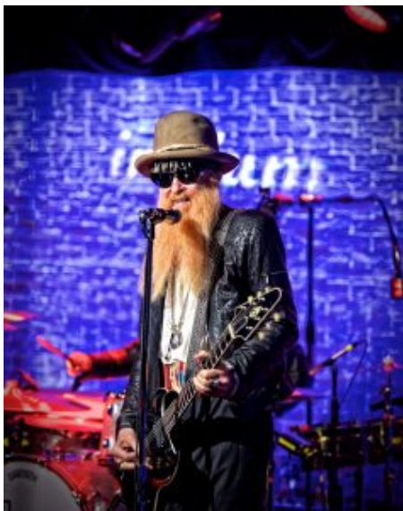
Tickets for a show last fall by Billy Gibbons of ZZ Top went for $500.

"We started booking more contemporary acts in the new space," Strum said. "We wanted to be more rock, blues, and jazz to pay tribute to Les, who played in many different genres. It took a few years for people to catch on to what we were doing."