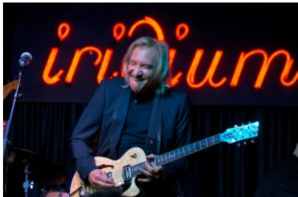
The Eagles’ Joe Walsh takes the stage regularly.

Other artists that have played The Iridium stage over the last 25 years include Joe Jackson, Rob Thomas, Tom Bailey,